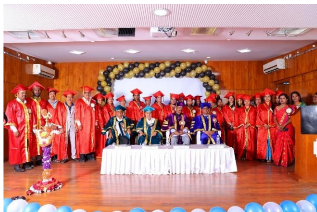
Graduates with Dignitaries