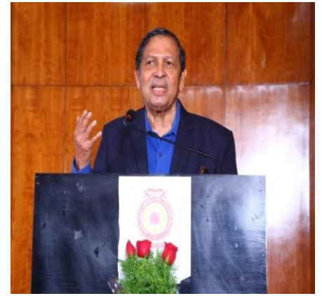
Chief Justice Presenting the Keynote Address