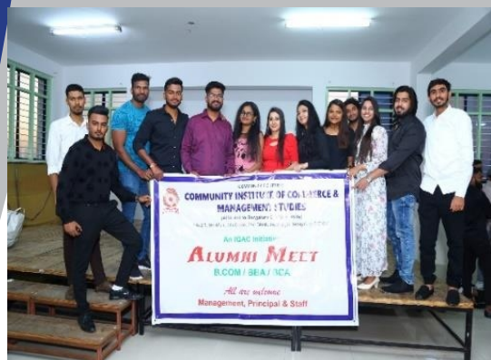
Family Reunion at Alumni Meet 29th January 2023

As Graduation Day echoes died in the auditorium, the footsteps of the Alumni resonated in the corridor who poured in substantial numbers chattering happily, smiling laughing, communicating with one another and greeting their former teachers. Excitement was rife in the air as they had so much to catch up with.