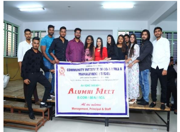
Lighter Moments at Alumni Meet