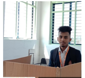
Mock Voting Session