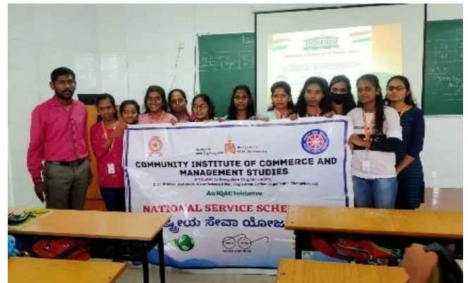
Indian Constitution Day