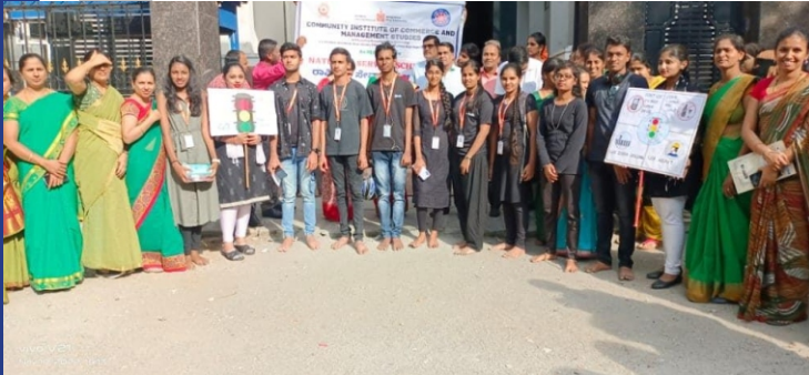
Street Play on Riding Safe