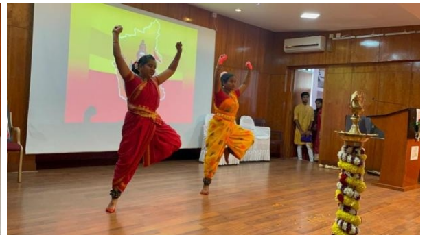
Rajyotsva Day Excerpts -Colouring the Campus with exciting bright red and yellow