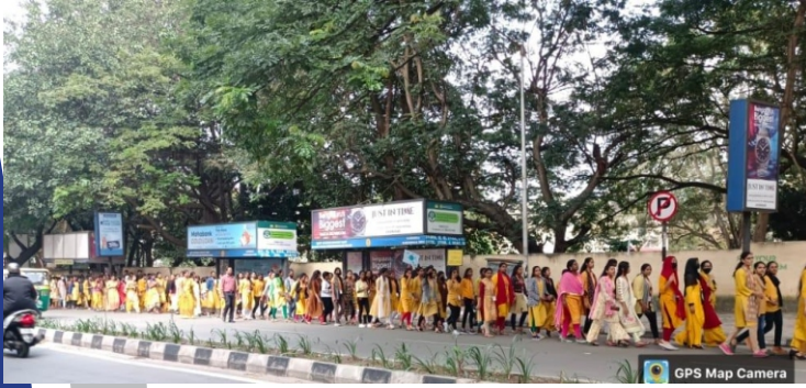
Road Safety Awareness Walkathon