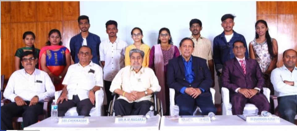
Dignitaries with College and course toppers 2019-22