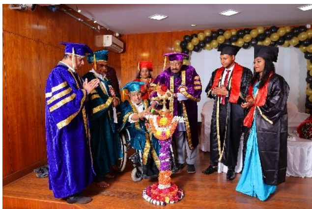
Kindling the Lamp of Knowledge