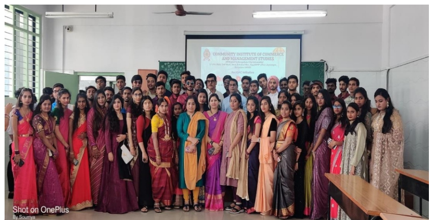
Culture Speaks Loud In Colours