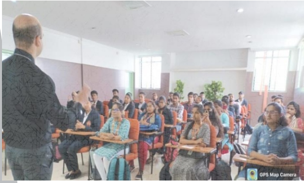
Understanding Job Market