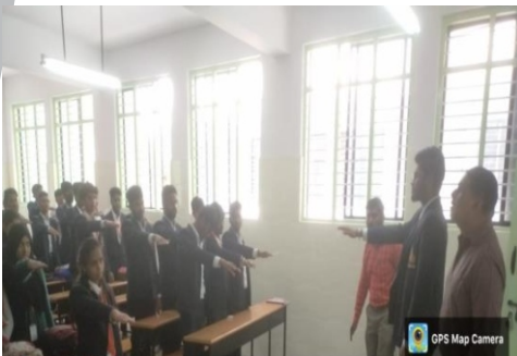
Pledge for Unity