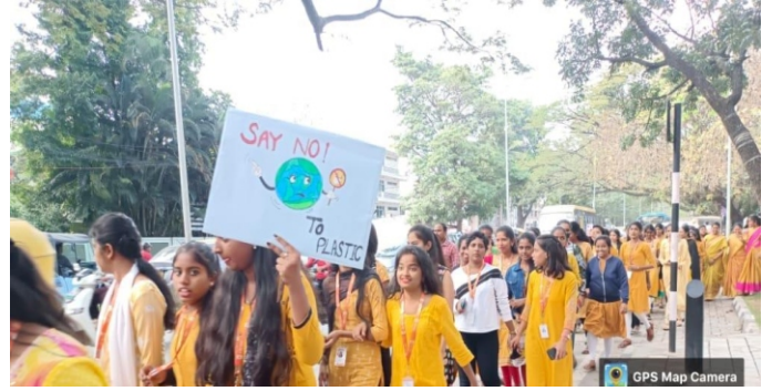
Plastic is Caustic