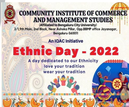
Myriads of Culture on Ethnic Day