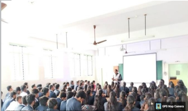
Financial Literacy & Decision Making