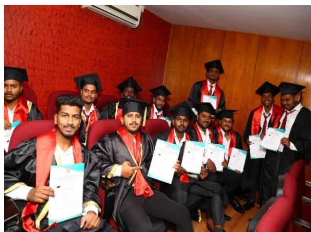
Dreaming of a Bright Future