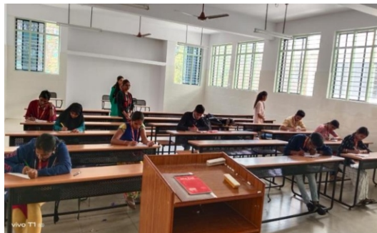
Essay Competition on Voting Awareness