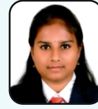
ASHA M S 9.56