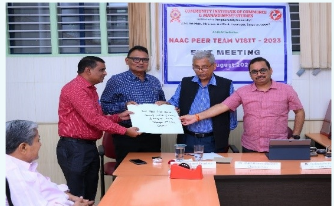
NAAC Peer Team Members Handing over the Assessment Report