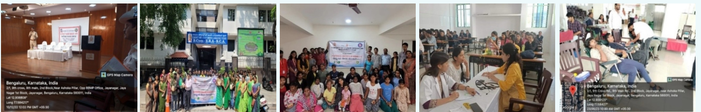
Drug Awareness Workshop