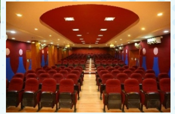
State of the Art Auditorium