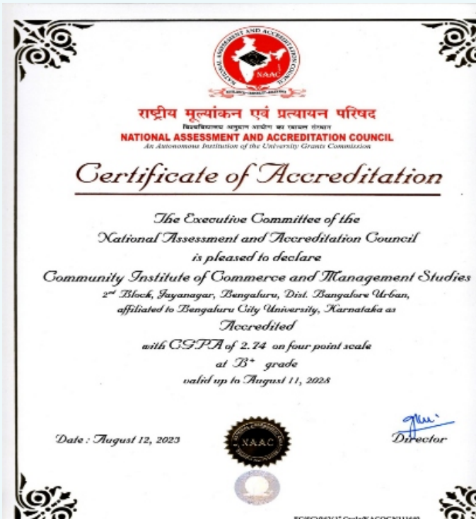
NAAC Accreditation Certificate

The NAAC Peer Team visit on 4 & 5th August 2023 threw us into throes of delight and despair. It was a defining moment for the institution which enhanced its visibility in academic circles. The day dawned crystal clear and as our pulsed throbbed with fearful trepidation, the NAAC Peer Team stepped in to start the process of accreditation. Two days of tumultuous visit we faced with fortitude which won us the much coveted B+ Grade.