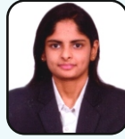
HAFIFA HOOR V K 9.12