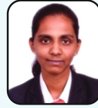
GANGA M 9.08