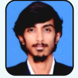
TEJAS N 9.06