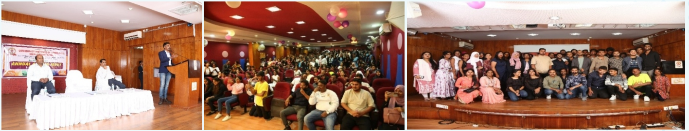
A time to reminisce, reconnect, and reignite

'In the tapestry of life, our alma mater's colours are woven deep into their souls. Our Alumni returned to their alma mater with nostalgic memories, reviving old experiences and reuniting with their peers and teachers.