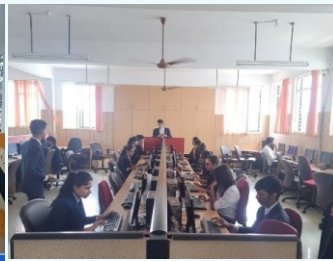
Computer Lab Wing